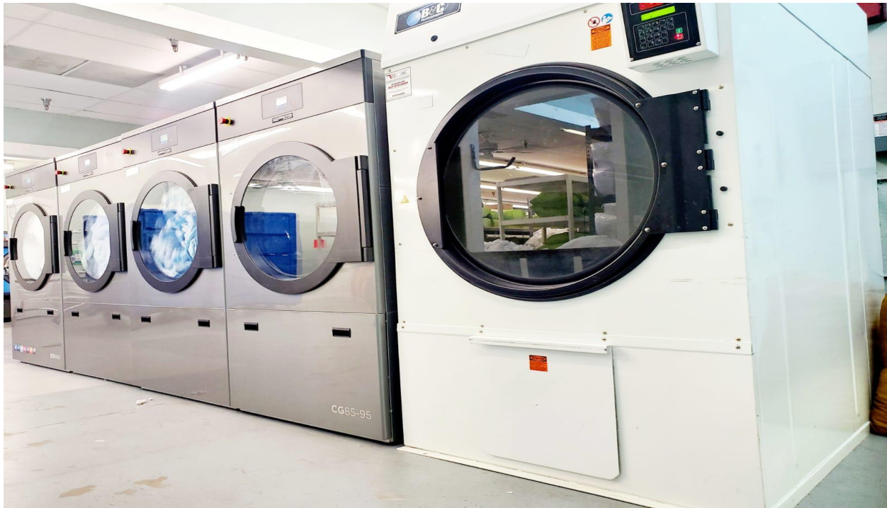
Our dryers are able to launder over 600 pounds of linen ever 30 minutes.