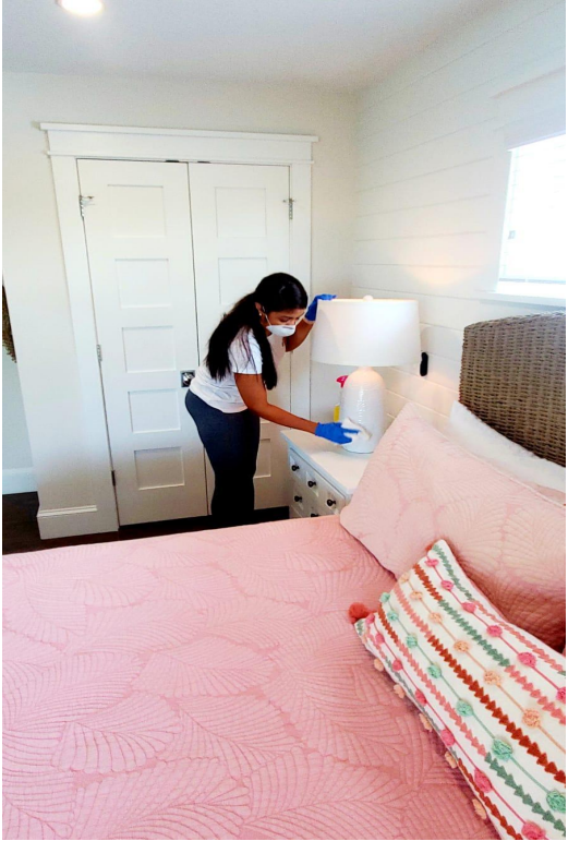
Housekeeper – Cleaning Photo